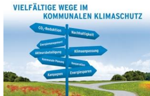
Title image of the 2014 competition showing many ways to municipal climate action

Since 2008, the National Climate Initiative (NCI) supports municipalities, in particular through the Funding Scheme for Local Government ('Kommunalrichtlinie', KRL). It offers cities, municipalities and rural districts financial support for their local climate protection strategies and investment projects. In addition to this, the municipalities can draw upon the assistance of the Service Centre for Municipal Climate Action, which was also founded in 2008 and merged with the project 'Information, communication and competition on municipal climate protection' in 2012. This joint undertaking operates under the name Service and Competence Centre for Municipal Climate Action (SK:KK) and is the main focal point for local authorities when it comes to climate action. The SK:KK provides information and assists municipalities in questions regarding all NCI funding programs, it networks all participants and integrates the practical experience acquired into the political process.