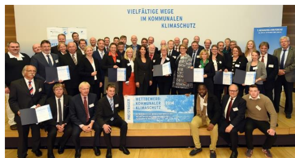
Winners of the ‘Municipal Climate Action’ competition in 2014

year, up to two themed issue publications are released with special editorial features. They each illustrate municipal practices on a particular topic. In 2015, for instance, the publications ‘Climate action and participation’ and ‘Climate action and climate adaptation’ appeared.